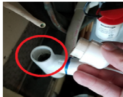
Pour bleach down your AC drain monthly to prevent CO$TLY water intrusions! And check your FREON!