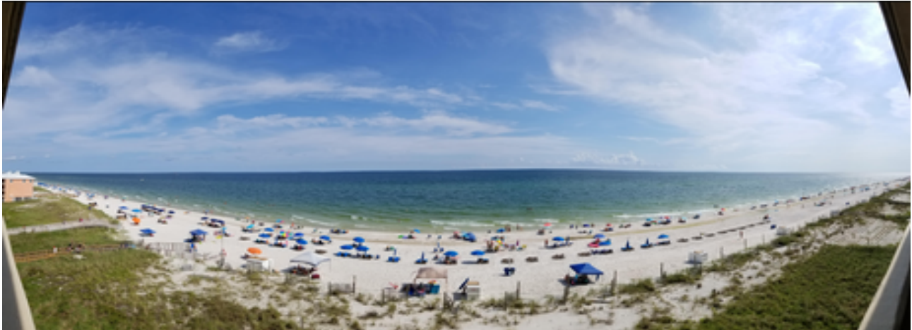
Frequent scattered showers in August, but beautiful weather in between!