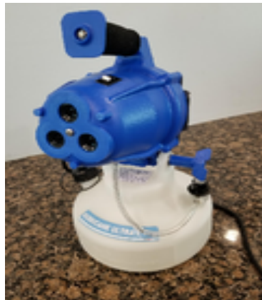
Disinfectant fogger: the weapon against Covid-19!