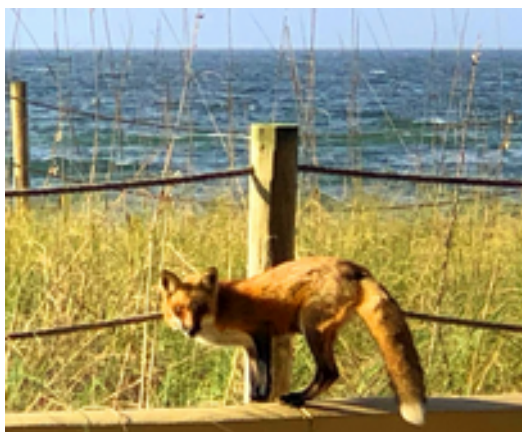
This beautiful fox comes by every morning!