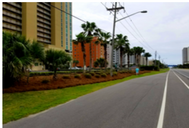
Our new landscaper has made a great first impression! And that means CSW makes a great first impression!