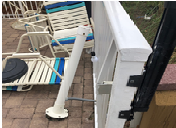
Furniture also slammed into the fence and the gate! A new bollard is ordered and we'll fix the rest.