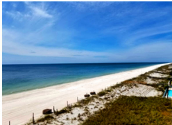
This beautiful beach is waiting for beach-goers!